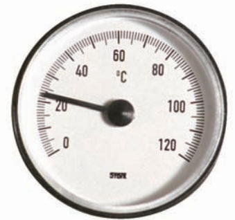
All units are fitted with a temperature indicator

Nb: Tip-Toe anode protection available upon request